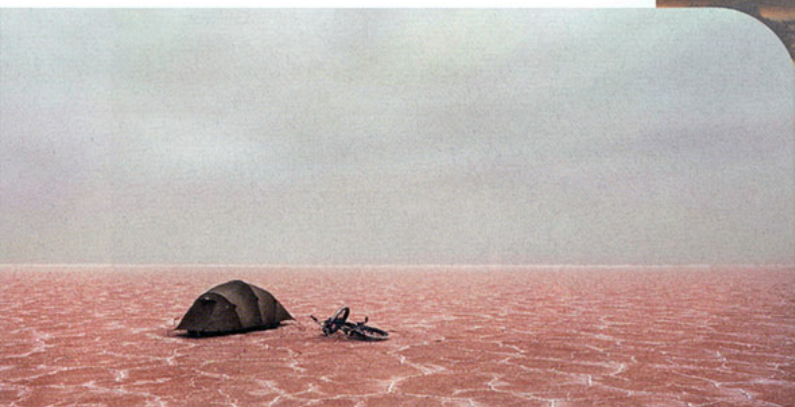
ONE OF THE STUNNING SHOTS FROM THE FILM